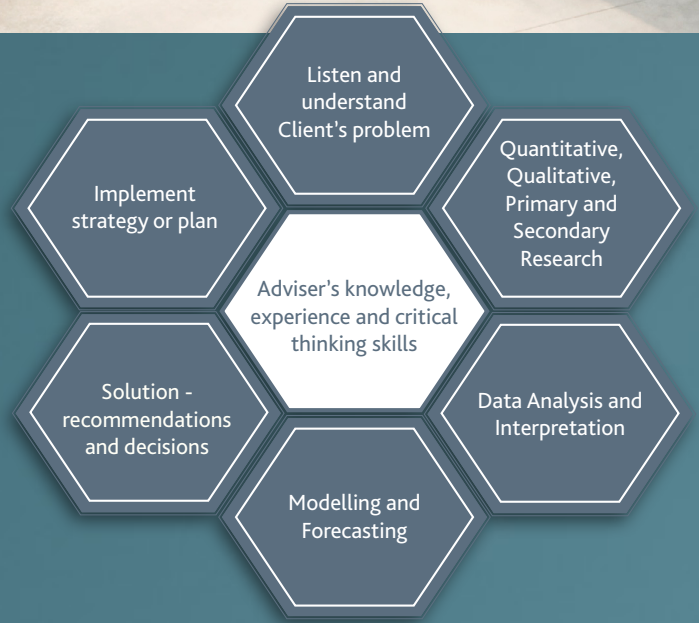
Value adding delivery model creating bespoke solutions

We have a team of strategic advisers who understand the nature of the modern environment of business which is riddled with volatility, uncertainty, complexity, and ambiguity. We can help you make the right decisions by providing clarity to the challenges you're facing and creating customised and realistic solutions to maximise your opportunities and manage risks.